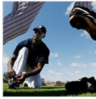
Yanks' Quiet Bullpen Acquisition Impresses