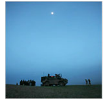
Choosing Which War to Fight