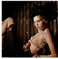
T Magazine: Women's Spring Fashion