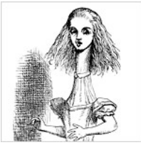
Migraine: 'Curiouser and Curiouser'