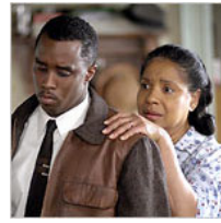
A Tale of Race, Family and a $10,000 Question